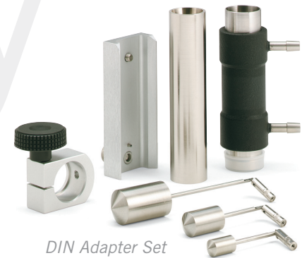
DIN Adapter Set