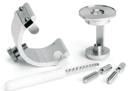
Spiral Adapter Set

Compatible with standard Brookfield Viscometers & DV3T Rheometers